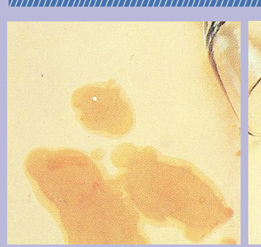
Normal surface absorbs and stains result

For detail product and technical information please refer to our web site.