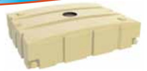
2000L Underdeck Tank 1785mm W x 2360mm L x 550mm H