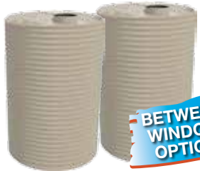
Twin Slender Option ( 2 x 2500L ) 1320mm D x 2060mm H