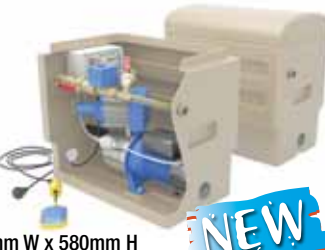
540mm L x 375mm W x 580mm H

Auto Mains Water Switching Device with the intelligence to switch between mains water & tank water as necessary.