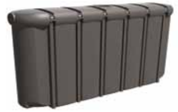
3500L Slimline Smooth 780mm W x 3020mm L x 1915mm H