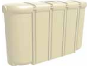
2500L Slimline Smooth 780mm W x 2510mm L x 1910mm H