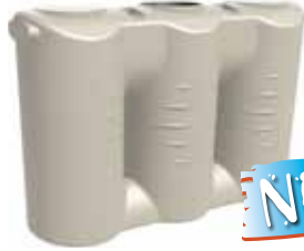
3000L Slimline Smooth 850mm W x 2470mm L x 2030mm H