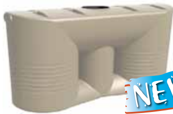
5000L Slimline Smooth 1150mm W x 3100mm L x 1950mm H