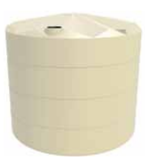
10000L Banded 2560mm D x 2260mm H