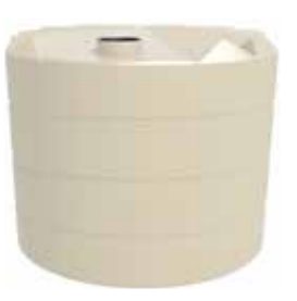
5000L Banded 2010mm D x 1970mm H