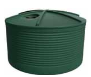
7000L Corrugated 2570mm D x 1770mm H