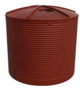
11500L Corrugated 2600mm D x 2520mm H