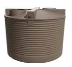
5000L Corrugated 2015mm D x 1850mm H